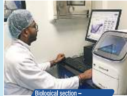
Biological section – Molecular biology with RT PCR