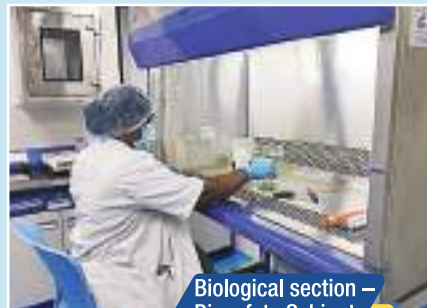
Biological section – Biosafety Cabinet