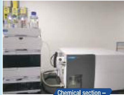
Chemical section – LC-MS/ MS