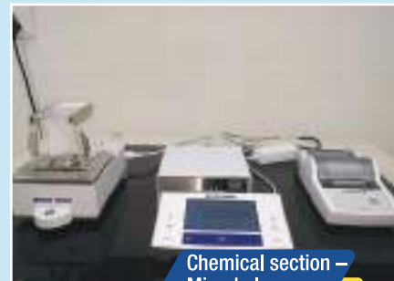
Chemical section – Microbalance