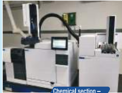
Chemical section – GC-MS/ MS Headspace