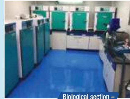
Biological section – Incubation Room