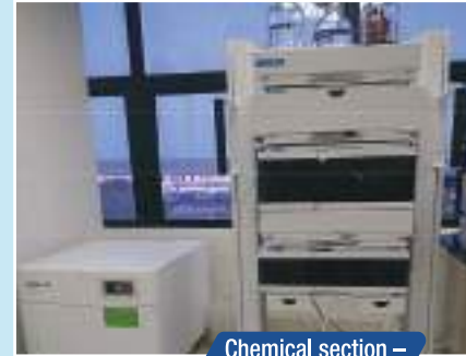
Chemical section – HPLC – DAD & RI