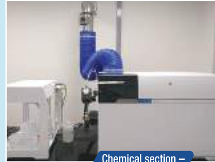
Chemical section – ICP-MS