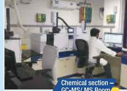
Chemical section – GC-MS/ MS Room